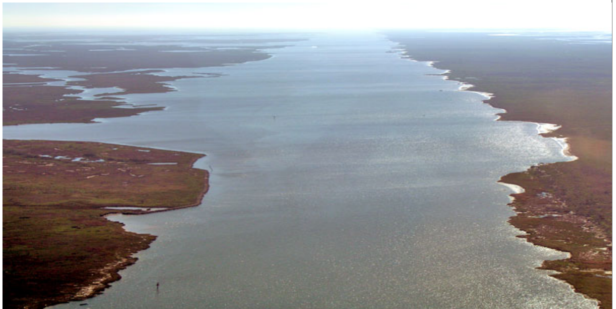
The erosion caused by the MRGO is clearly visible in this aerial photo. A drive down Judge Perez Highway also reveals all of the damage done to the cypress swamps of St. Bernard Parish.

The U.S. Army Corps of Engineers estimates the parish has lost nearly 1,500 acres of cypress swamps and levee forest, over 10,300 acres of brackish marsh, 3,400 acres of freshwater marsh, and 4,200 acres of saline marsh as a direct consequence of the MRGO.